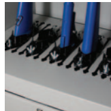
Universal Base Use in conjunction with the EZ Rail or support rail, and with Spacesaver weapons storage components.