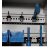
EZ Rail™ Element Innovative engineering offers flexible storage of hanging bins, slat wall accessories and weapons storage components.