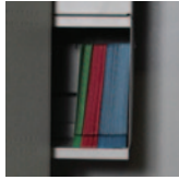
Modular Shelf Available in 12" and 24" heights. Add accessories like the file divider kit to further compartmentalize and customize the locker.