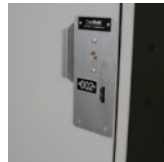
Lock Options Lock options include hasp only for pad lock, keyed lock or combination lock.