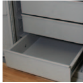
Internal Drawers 6 and 9 inch high drawers offer more custom space, and are available in locking or non-locking configurations.