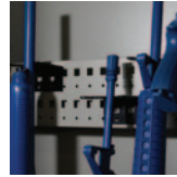
Support Rail Use with Spacesaver weapons storage components or other specialty storage accessories.