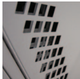
Visibility/Circulation Diamond perforated doors offer visibility as well as natural air circulation and ventilation.