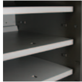
Adjustable Shelf Available in standard and heavy duty capacities for storing everything from clothing to ammunition.