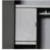
Lockable Box Kit Use this kit and add a lock to store hand guns and other valuables.