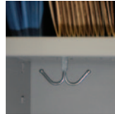
Hook Kits Add single hooks to the side of the modular shelf or a double-hook to the bottom for more hanging storage.