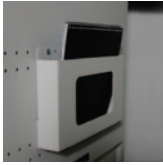
Document Holder Door-mounting allows easy access to documents and notebooks.

Unique design allows infinite custom configurations and adjustments. Many options are available, including magnetic mirrors, boot trays and standard peg board designed doors.