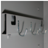
3-Hook Bracket Hook bracket can be moved up and down, and from one side of the locker to another.