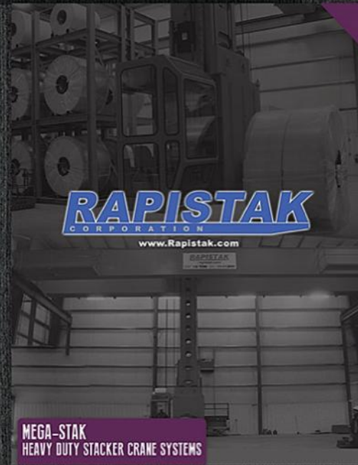
MEGA-STAK HEAVY DUTY STACKER CRANE SYSTEMS