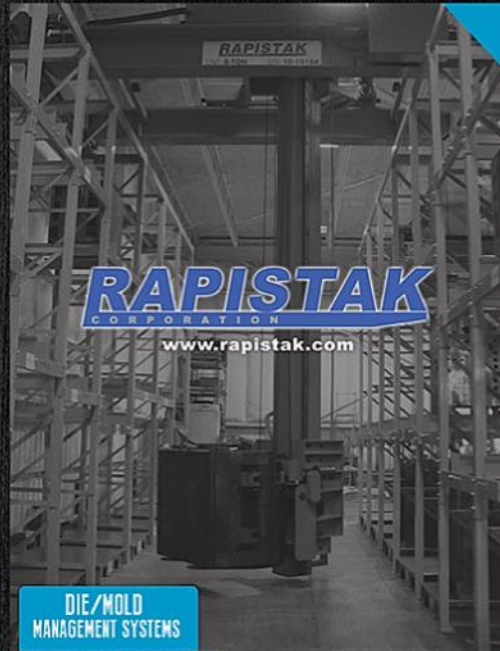
DIE/MOLD MANAGEMENT SYSTEMS