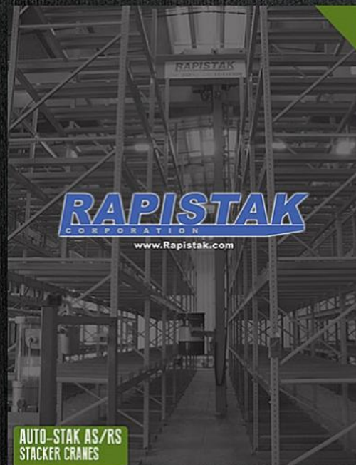
AUTO-STAK AS/RS STACKER CRANES