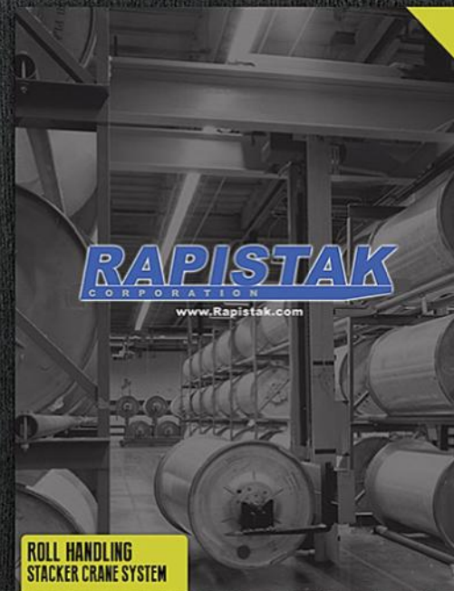
ROLL HANDLING STACKER CRANE SYSTEM